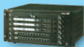
Advanced TCA System