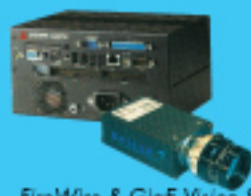
FireWire & GigE Vision Solutions