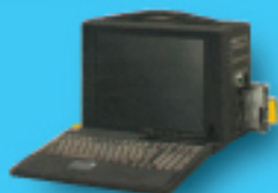
PXI portable platforms