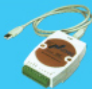
Remote DAQ Modules