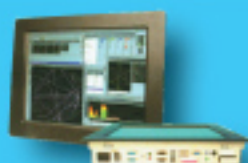
LCD Display & Panel PC