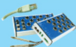
Ethernet I/O Modules