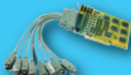
Multiport Serial Communication Card