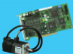
Advanced Motion Control Card