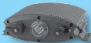
IP67 Water-Proof PC